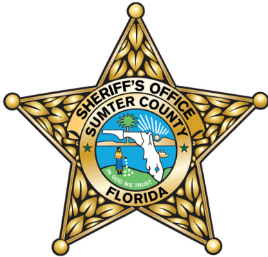
Sumter County Sheriff Office