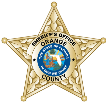
Orange County Sheriff Office