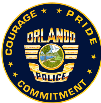
Orlando Police Department