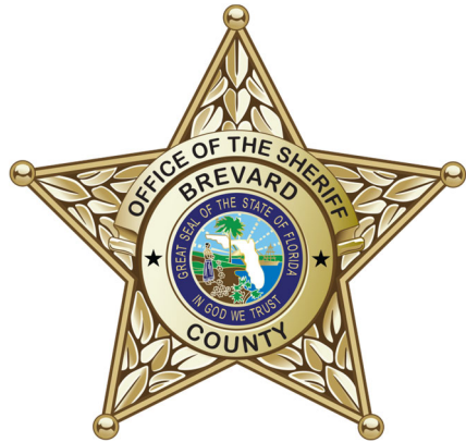
Brevard County Sheriff Office