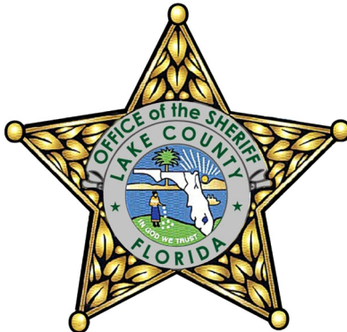
Lake County Sheriff Office