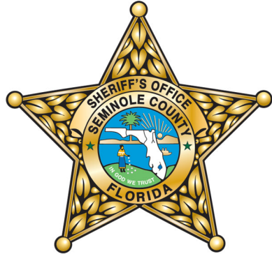
Seminole County Sheriff Office