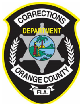
Orange County Corrections