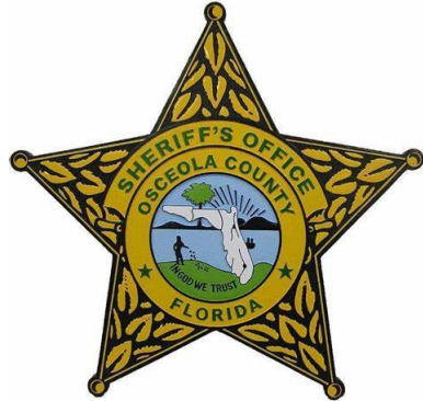
Osceola County Sheriff Office