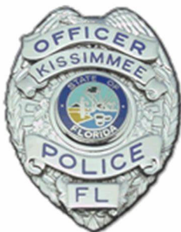
Kissimmee Police Department