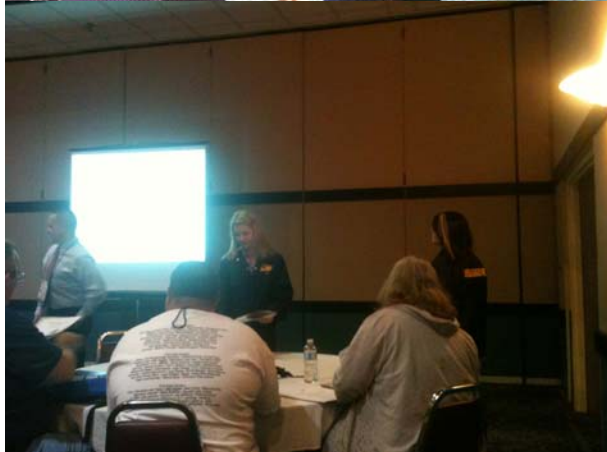
Class on the use of Facebook