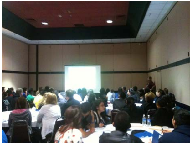
Class on Gangs