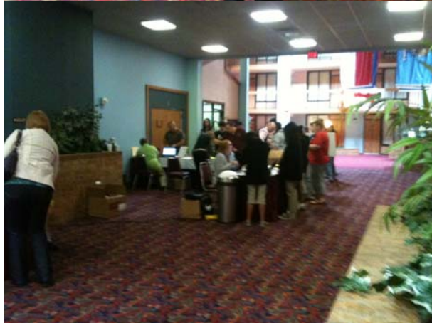
Check in desk