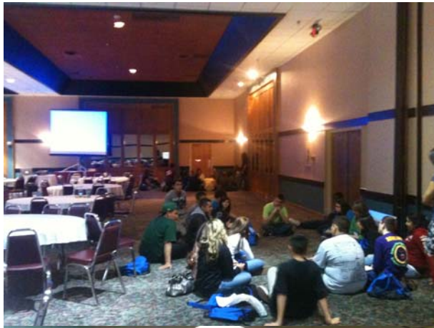
Students having discussion groups

Some photos of the Texas Student Crime Stoppers conference.