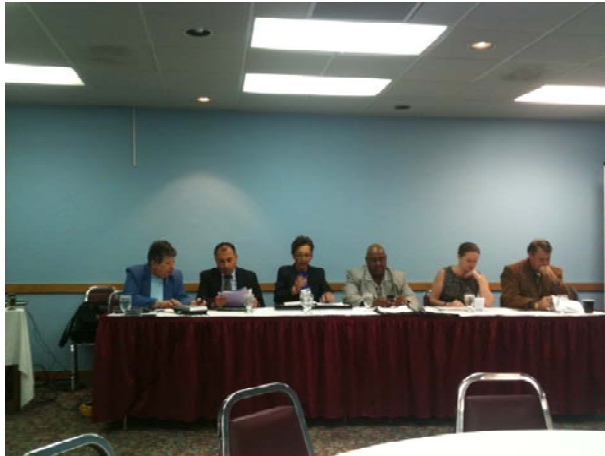
Texas Crime Stoppers Board of Directors